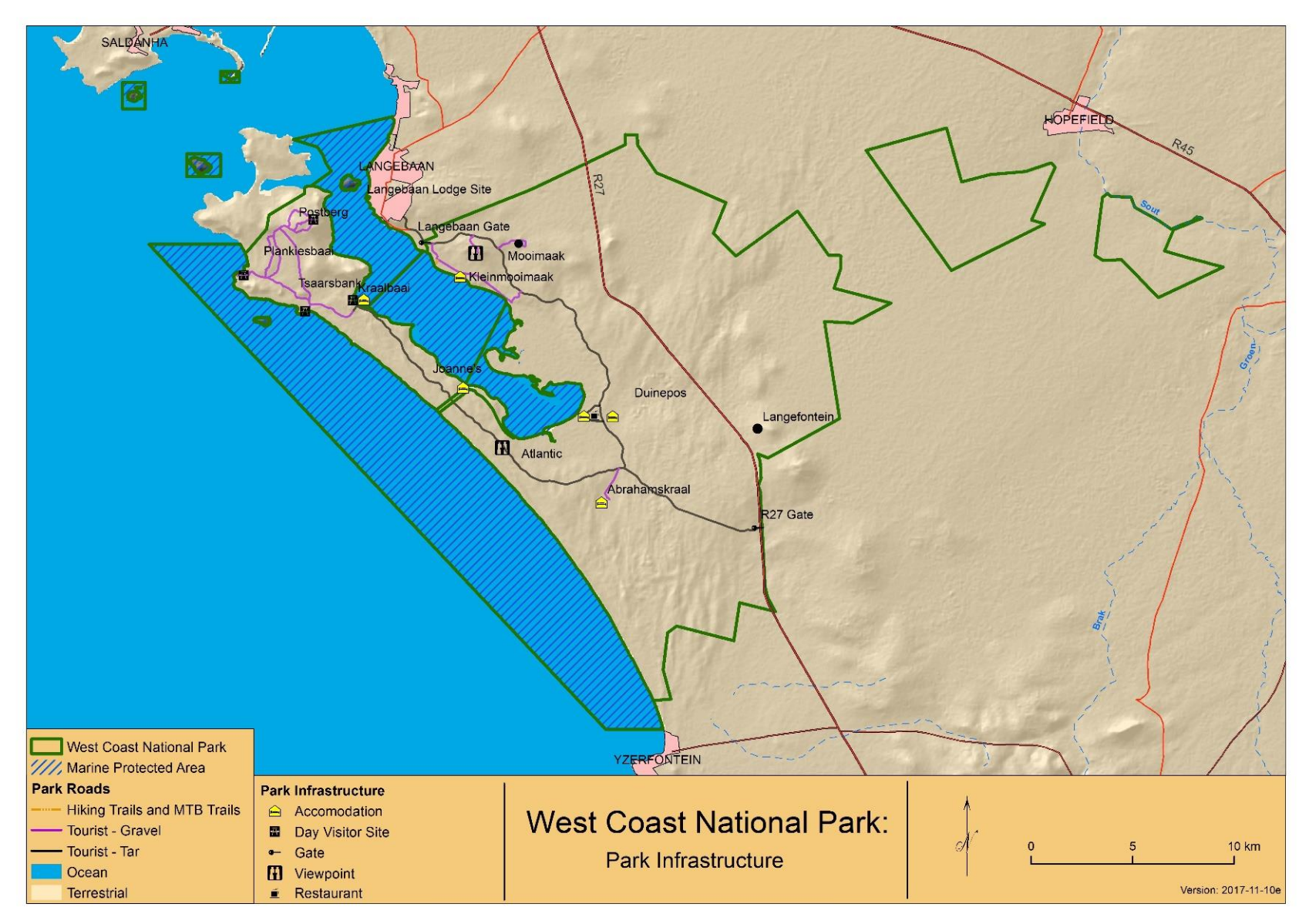
Map 2. Park infrastructure