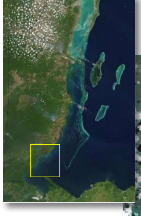
Location of Port Honduras Marine Reserve

Fringing mangroves provide important habitats for fish nurseries, particularly adjacent to the 138 cayes lying within the boundaries of the Marine Reserve, the majority of which remain undeveloped. Some are used by birds for nesting — magnificent frigatebirds, brown pelicans, and sooty terns among them, and hawksbill turtles are known to use the beaches of the Snake Cayes as nesting sites.