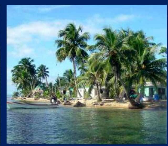
Punta Negra (Collins, 2004)